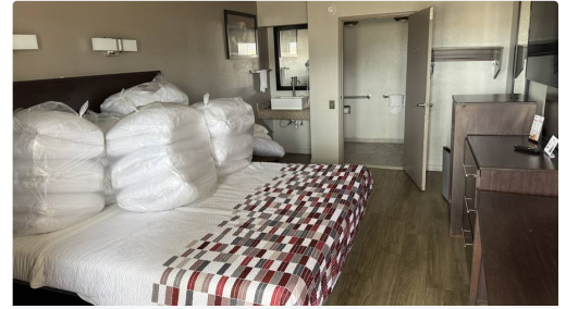
Interior — Guest Room