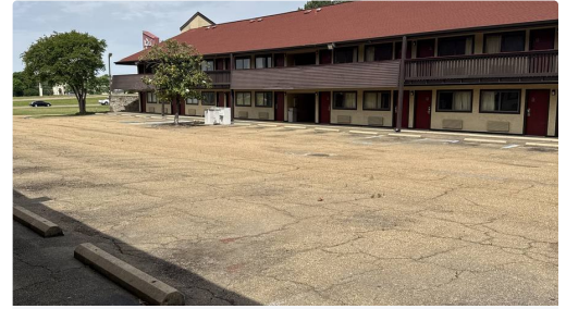
Exterior — Building & Parking Lot