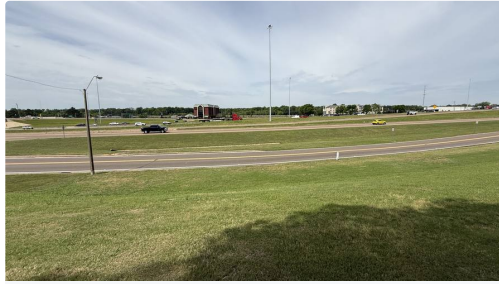
I-55 Frontage Road Visibility