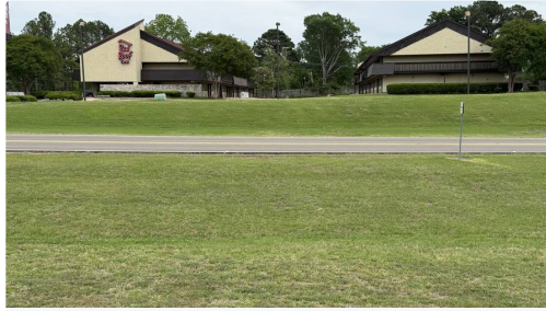
Exterior — Both Buildings from Street