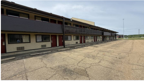
Exterior — Building Elevation