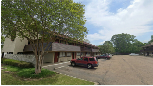
Street View — Entry Drive