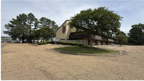
Exterior — Front View & Signage